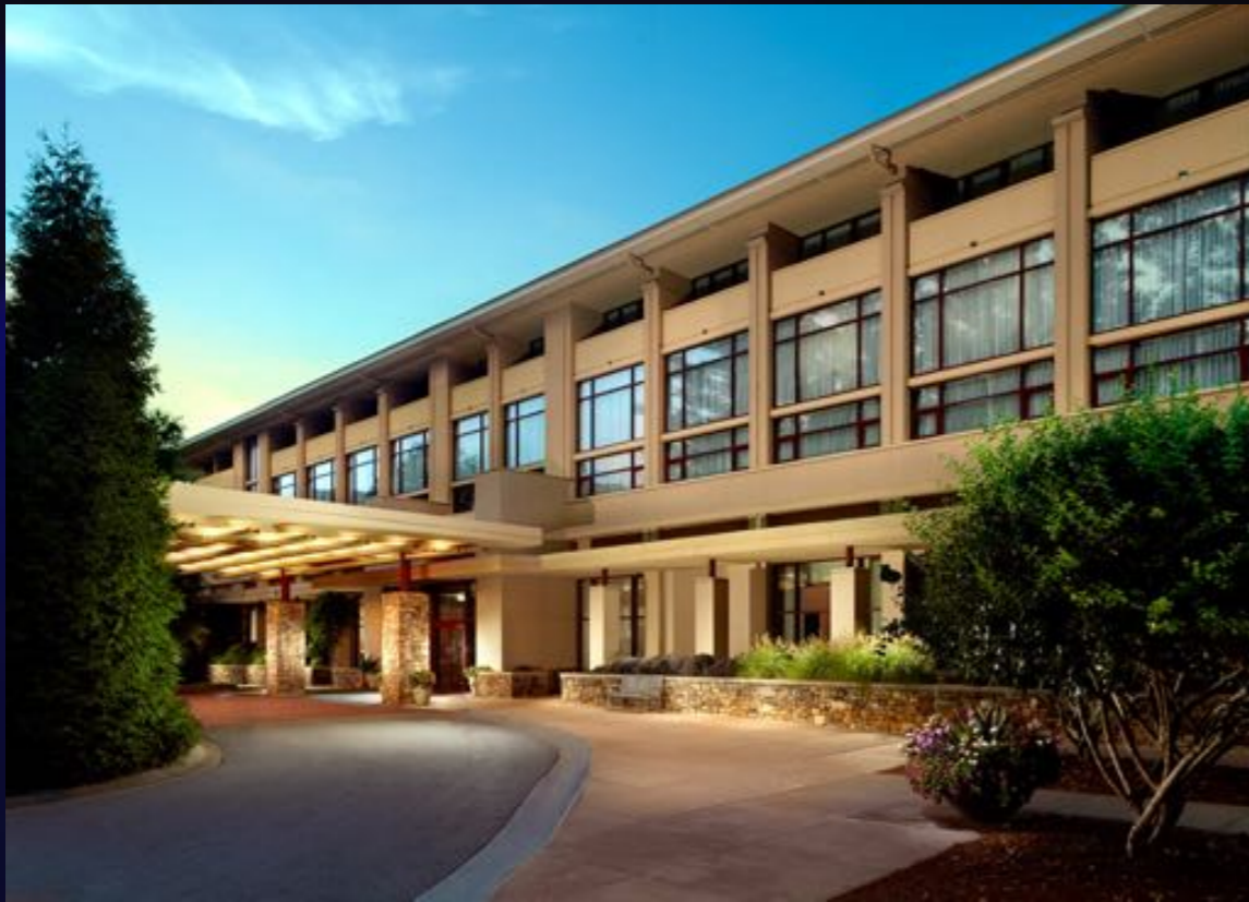
Atlanta - Emory Conference Center Hotel