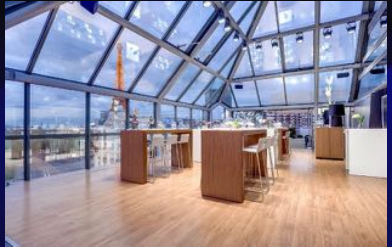
Paris - The New Cap Event Center